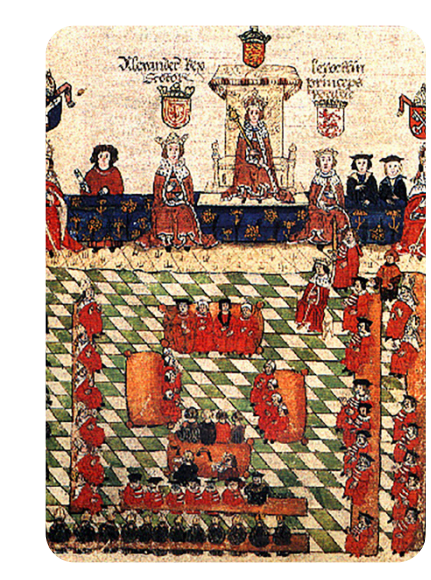
Edward I and the Model Parliament

The power of the monarchy has changed over time. In the past, some monarchs had absolute power. This meant that they could do whatever they wanted. Today, there is a constitutional monarchy. This means that the monarch is controlled by parliament and the government.