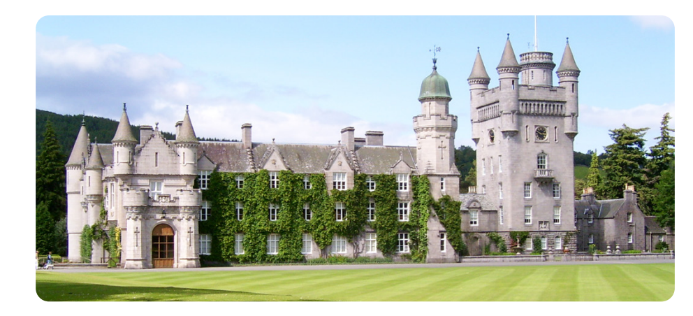
Balmoral Castle is in Aberdeenshire, Scotland.