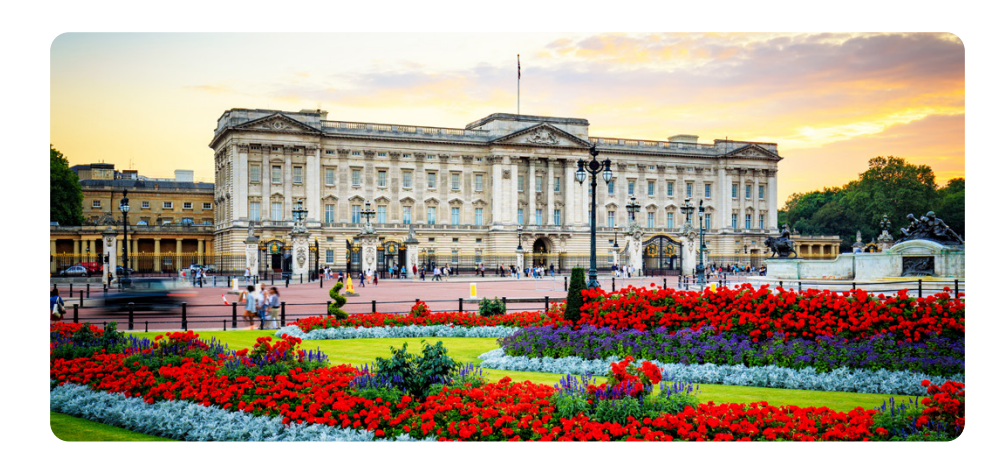
Buckingham Palace is in London, England.

Royal residencies include palaces, castles and stately homes. Some of them are used for official royal business. Some are used as holiday or private homes. Many are tourist attractions.