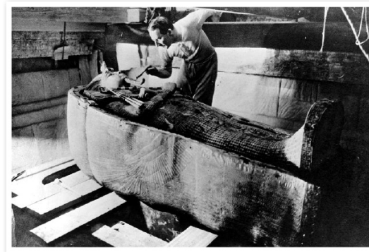
Howard Carter examining the tomb of Tutankhamun

A wealthy Englishman, Lord Carnarvon, was interested in ancient Egypt. He paid for an archaeologist called Howard Carter and a team of workers to carry out excavations in the Valley of the Kings on the west bank of the Nile, where they discovered Tutankhamun's tomb. It took Carter and his team 10 years to remove over 3000 items from the tomb. After the discovery, a series of strange events occurred, including the death of Lord Carnarvon. Many people believed a curse had been placed on Carter's team for disturbing the tomb.