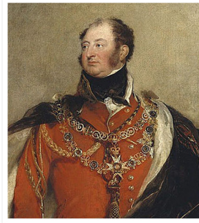
Portrait of Prince Frederick

The Grand Old Duke of York is thought to be about Prince Frederick, Duke of York and Albany, who was the second son of King George III. In 1794, Frederick was asked to lead a huge army against the French. Frederick was not a good leader, and he lost the battle. Frederick decided to learn how to be a better leader. He worked hard, and his army went on to win many battles.