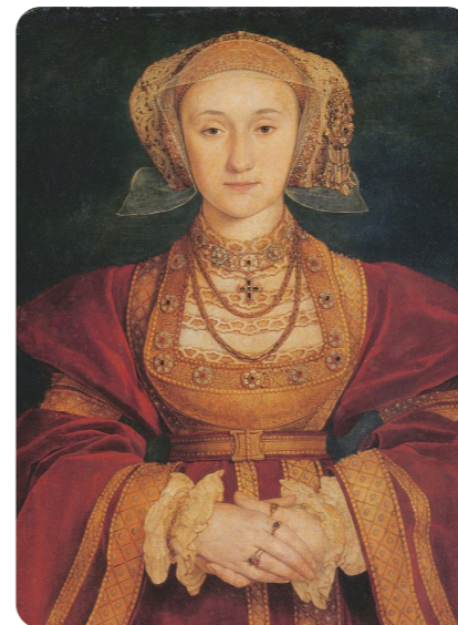
Anne of Cleves by Hans Holbein

Holbein was a German artist and portrait painter. He travelled to England in 1532 with the backing of Anne Boleyn and Thomas Cromwell. In 1535, he became the King's Painter. Holbein painted many portraits of the royal family and the nobles. He was also asked to paint a picture of Anne of Cleves so Henry could decide if he wanted to marry her. Henry liked the portrait but the marriage only lasted six months because Anne didn't look as beautiful in real life as she did in her portrait.