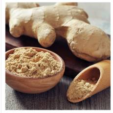
Ginger is a spice.