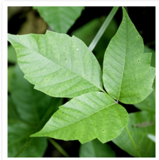
Poison ivy can cause an itchy rash if touched.